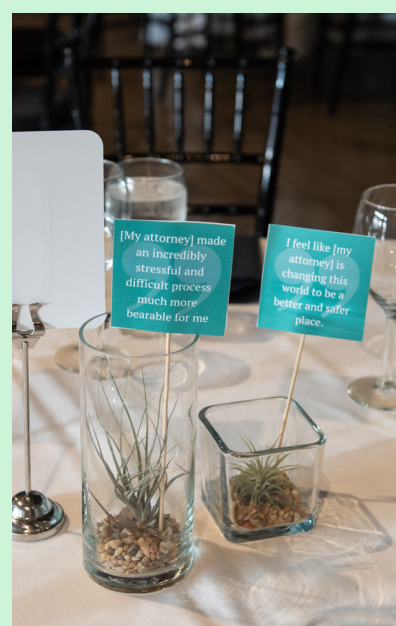
Click here for full gallery.